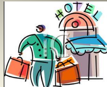
宾馆 / 饭店