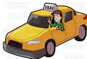
出租汽车 chu1 zu1 qi4 che1