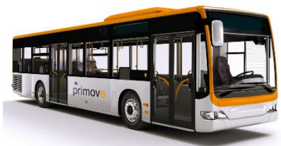
公共汽车 gong1 gong4 qi4 che1