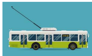
电车 dian4 che1