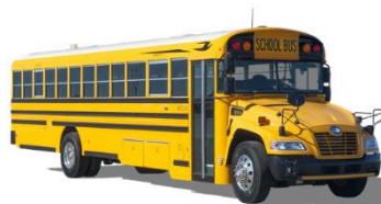
校车 xiao4 che1