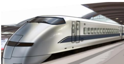
火车 huo3 che1