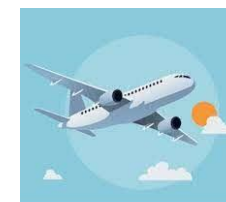
飞机 fei1 ji1