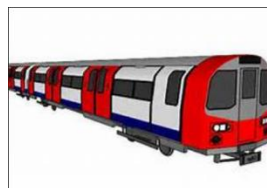
地铁 di4 tie3